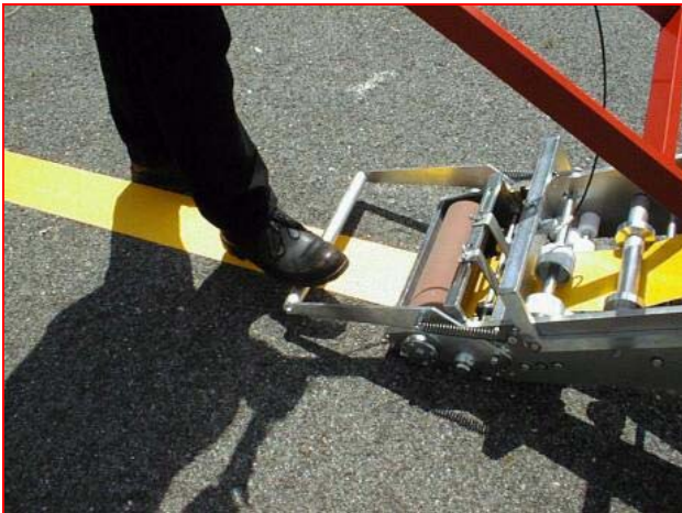
Figure 10: Cutting the tape