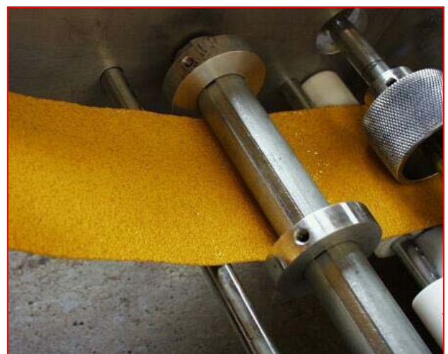
Figure 3: Feeding of the Tape

Caution: Do not activate the cutting knife, while doing adjustments!