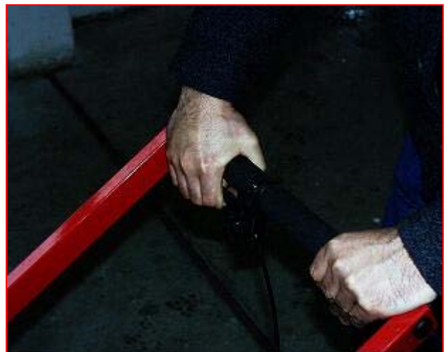
Figure 8: Infedding Handle Grip

For starting the application pull handgrip and watch tape being moved by infedding-transportation roll. Position tape start at start of pre-marking. Push applicator forward and keep handle grip pulled until tape appears on other side of rubber application roll. Release handle-grip and keep pushing applicator.