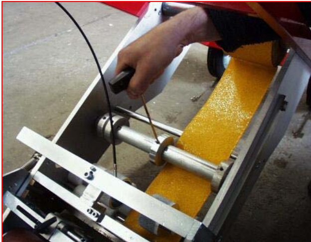
Figure 4: Adjustment of the upper tape guide rolls