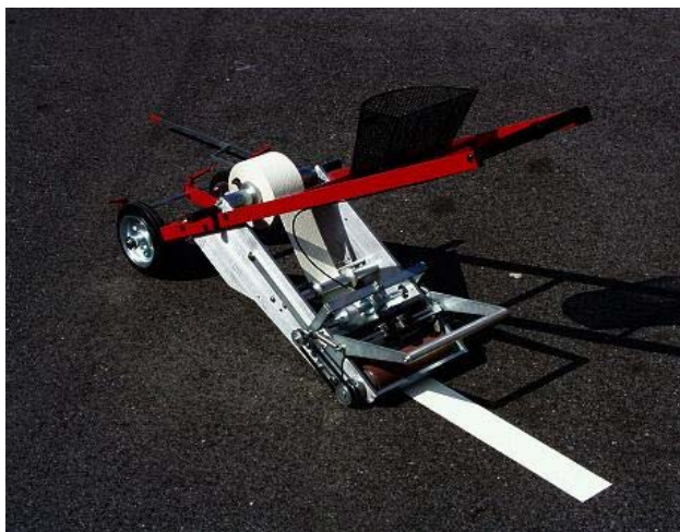
Figure 1: MTA-2 Tape applicator

The 3M™ Manual Tape Applicator MTA-2 is intended to be used for the application of 3M™ Stamark™ Pavement Marking Tapes. It is a simple-to-use, two-wheeled, robust, push-type device. (Figure 1)