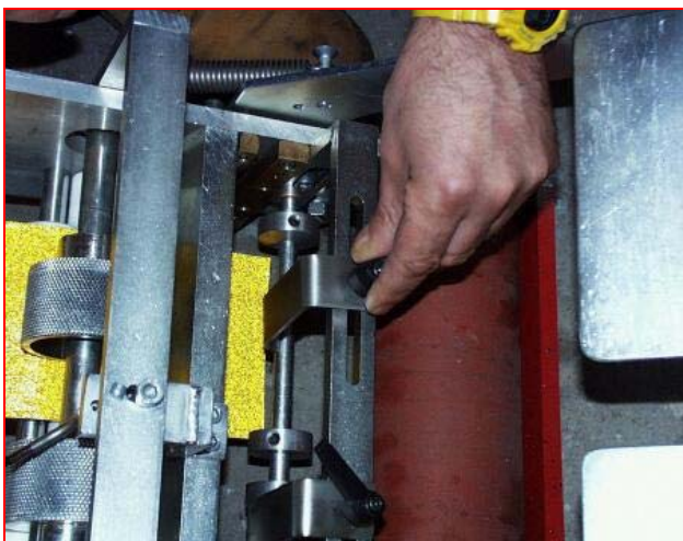
Figure 6: Adjustment of vertical guide plate