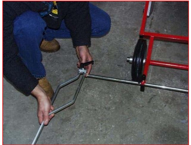
Figure 7: Adjustment of the pointer system